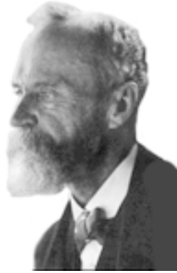
William James , Thoemmes Press

About the author. . . . William James (1842-1910), perhaps the most prominent American philosopher and psychologist, was an influential formulator and spokesperson for pragmatism. Early in his life, James studied art, but later his curiosity turned to a number of scientific fields. After graduation from Harvard Medical College, James’ intellectual pursuits broadened to include literary criticism, history, and philosophy. He read widely and contributed to many different academic fields. The year following graduation, James accompanied Louis Agassiz on an expedition to Brazil. 1 As a Harvard professor in philosophy and psychology, James achieved recognition as one of the most outstanding writers and lecturers of his time.