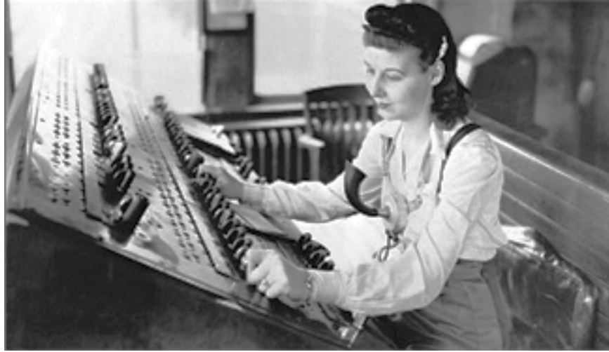
Switchtender on Pennsylvania Railroad

drawing water, just to keep himself alive? Tolstoi’s philosophy, deeply enlightening though it certainly is, remains a false abstraction. It savors too much of that Oriental pessimism and nihilism of his, which declares the whole phenomenal world and its facts and their distinctions to be a cunning fraud.