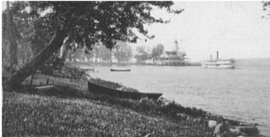
The Boat Landing, Lake Chautauqua, New York

goodness too uninspiring. This human drama without a villain or a pang; this community so refined that ice-cream soda-water is the utmost offering it can make to the brute animal in man; this city simmering in the tepid lakeside sun; this atrocious harmlessness of all things,—I cannot abide with them. Let me take my chances again in the big outside worldly wilderness with all its sins and sufferings. There are the heights and depths, the precipices and the steep ideals, the gleams of the awful and the infinite; and there is more hope and help a thousand times than in this dead level and quintessence of every mediocrity.”