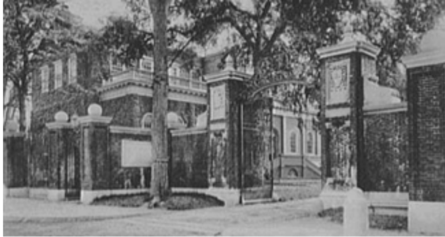
Harvard Gate, Harvard College, Library of Congress

fighting virtue or the intellectual breadth, we must side with Tolstoï, and choose that simple faithfulness to his light or darkness which any common unintellectual man can show.