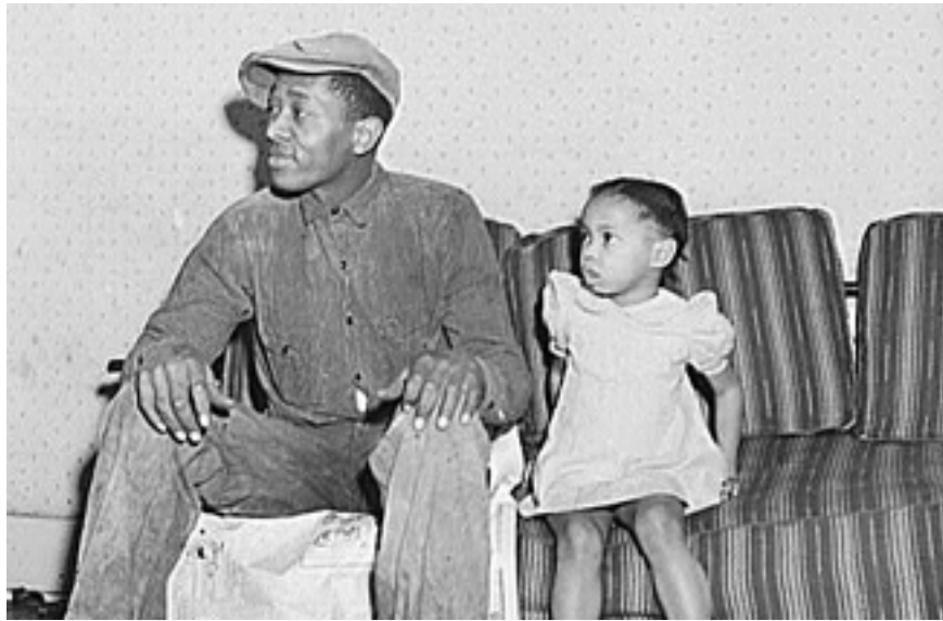
Steelworker with Daughter, Ambridge, Pennsylvania

ought to be willing permanently to remain. And why is this so? Is it because they are so dirty? Well, Nansen grew a great deal dirtier on his polar expedition; and we think none the worse of his life for that. Is it the insensibility? Our soldiers have to grow vastly more insensible, and we extol them to the skies. Is it the poverty? Poverty has been reckoned the crowning beauty of many a heroic career. Is it the slavery to a task, the loss of finer pleasures? Such slavery and loss are of the very essence of the higher fortitude, and are always counted to its credit,—read the records of missionary devotion all over the world. It is not any one of these things, then, taken by itself,—no, nor all of them together,—that make such a life undesirable. A man might in truth live like an unskilled laborer, and do the work of one, and yet count as one of the noblest of God’s creatures. Quite possibly there were some such persons in the gang that our author describes; but the current of their souls ran underground; and he was too steeped in the ancestral blindness to discern it.