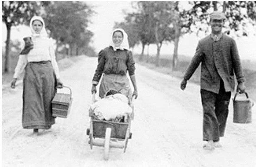
Three Peasants Walking to Market

This, as I said, became for a time my conviction, and gave me great content. I have put the matter into the form of a personal reminiscence, so that I might lead you into it more directly and completely, and so save time. But now I am going to discuss the rest of it with you in a more impersonal way.