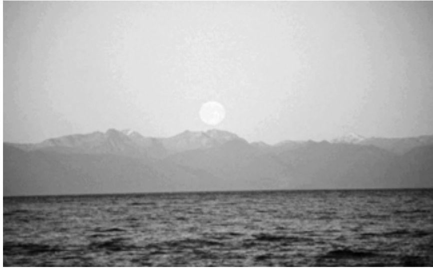
Moonrise at Chatham Strait

Now if this be so, nothing is or takes place fortuitously, either in the present or in the future, and there are no real alternatives; everything takes place of necessity and is fixed. For either he that affirms that it will take place or he that denies this is in correspondence with fact, whereas if things did not take place of necessity, an event might just as easily not happen as happen; for the meaning of the word “fortuitous” with regard to present or future events is that reality is so constituted that it may issue in either of two opposite directions. Again, if a thing is white now, it was true before to say that it would be white, so that of anything that has taken place it was always true to say “it is” or “it will be.” But if it was always true to say that a thing is or will be, it is not possible that it should not be or not be about to be, and when a thing cannot not come to be, it is impossible that it should not come to be, and when it is impossible that it should not come to be, it must come to be. All, then, that is about to be must of necessity take place. It results from this that nothing is uncertain or fortuitous, for if it were fortuitous it would not be necessary.