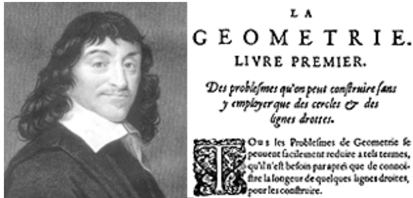
René Descartes and La Geometrie , Thoemmes

cohesion of two elements or two constituent ideas. In other words, the self-evident datum , which Descartes calls a “simple idea” or a “simple proposition,” is a hypothetical judgment so formulated that the antecedent immediately necessitates the consequent, though the consequent need not reciprocally involve the antecedent. 5