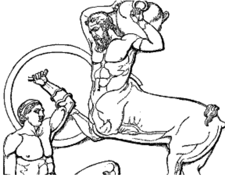
Centaur from the Parthenon, (detail) William Smith, A History of Greece .

upon any thinker for whom the earth and the solar system are to possess significance; i.e. , the Antipodes are a necessary constituent of a significant whole, as that whole must be conceived. 2