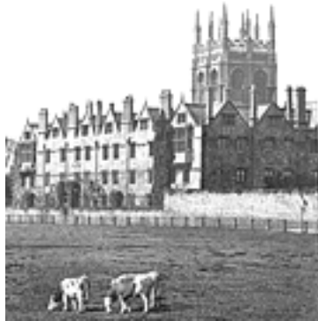
Merton College, Oxford