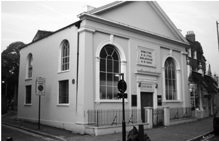
Richard Price’s Unitarian Chapel, Newington Green. Members of his congregation included Mary Wollstonecraft and John Adams.

First ... [e]very perception being the perception of something, implies some kind of reality distinct from and independent of itself; nothing being more grossly absurd, than to suppose the perception, or apprehension of a thing, to be the same with the thing itself. It would be as good sense to suppose examination, the same with the subject examined; the eye, the same with visible objects; memory, the same with the fact remembered; or desire, the same with the object desired. And yet this absurdity seems to be foundation of a system of scepticism which has been lately taught the world.