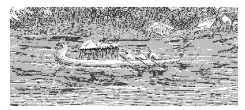
Crossing Over, detail from The Land of the Veda

Verily, due to sensuous craving, conditioned through sensuous craving, impelled by sensuous craving, entirely moved by sensuous craving, kings fight with kings, princes with princes, priests with priests, citizens with citizens; the mother quarrels with the son, the son with the mother, the father with the son, the son with the father; brother quarrels with brother, brother with sister, sister with brother, friend with friend. Thus, given to dissension, quarreling and fighting, they fall upon one another with fists, sticks, or weapons. And thereby they suffer death or deadly pain.