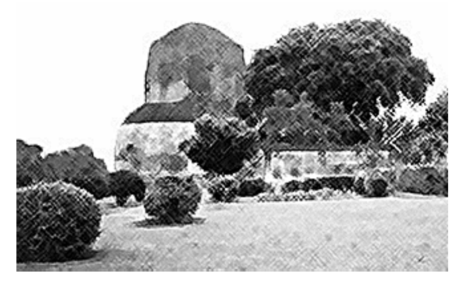
Deer Park