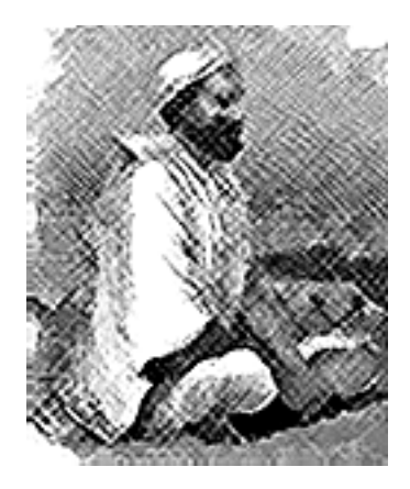
Yogi, detail from The Land of the Veda