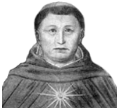
St. Thomas Aquinas

About the author. . . St. Thomas Aquinas (1225-1275), is generally considered to be the most prominent thinker during the Medieval period. Thomas, although primarily a theologian, argues philosophically in many of his works and, unlike St. Anselm, clearly distinguishes between the methods of philosophy and religion. He uses the scientific thought of Aristotle as a method of theological and philosophical understanding. Nevertheless, for Thomas, philosophy is primarily based on the use of reason, whereas religion is primarily based on the use of divine revelation provided by faith. Both kinds of knowledge, according to Thomas, are consistent and compatible. He is convinced metaphysics is the most important aspect of philosophy.