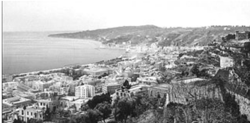
Il Posillipo, Naples, Italy

same respect, but only in different respects. For what is actually hot cannot simultaneously be potentially hot; but it is simultaneously potentially cold. It is therefore impossible that in the same respect and in the same way a thing should be both mover and moved, i.e. that it should move itself. Therefore, whatever is in motion must be put in motion by another. If that by which it is put in motion be itself put in motion, then this also must needs be put in motion by another, and that by another again. But this cannot go on to infinity, because then there would be no first mover, and, consequently, no other mover; seeing that subsequent movers move only inasmuch as they are put in motion by the first mover; as the staff moves only because it is put in motion by the hand. Therefore it is necessary to arrive at a first mover, put in motion by no other; and this everyone understands to be God.