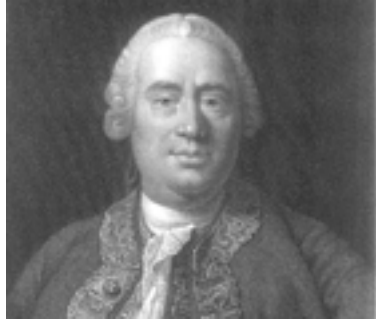
David Hume

About the author... Often considered a skeptic, David Hume (1711-1776) is perhaps the most influential philosopher to write in English. Although he sought acclaim as a historian, his empirical thought places “Logic, Morals, Criticism, and Politics” as a “science of man.” As part of his radical empiricism, Hume rejected the existence of causation, scientific law, material substance, spiritual substance, and the individual self. For him, only relationships among ideas can be known.