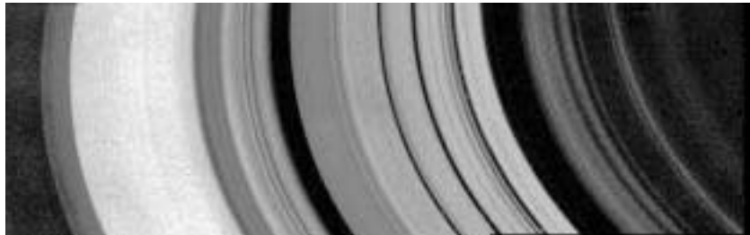
Mosaic of Saturn’s Rings

David Hume ( http://plato.stanford.edu/entries/hume/ ) Stanford Encyclopedia of Philosophy An outstanding and reliable summary of Hume’s contribution to philosophy.