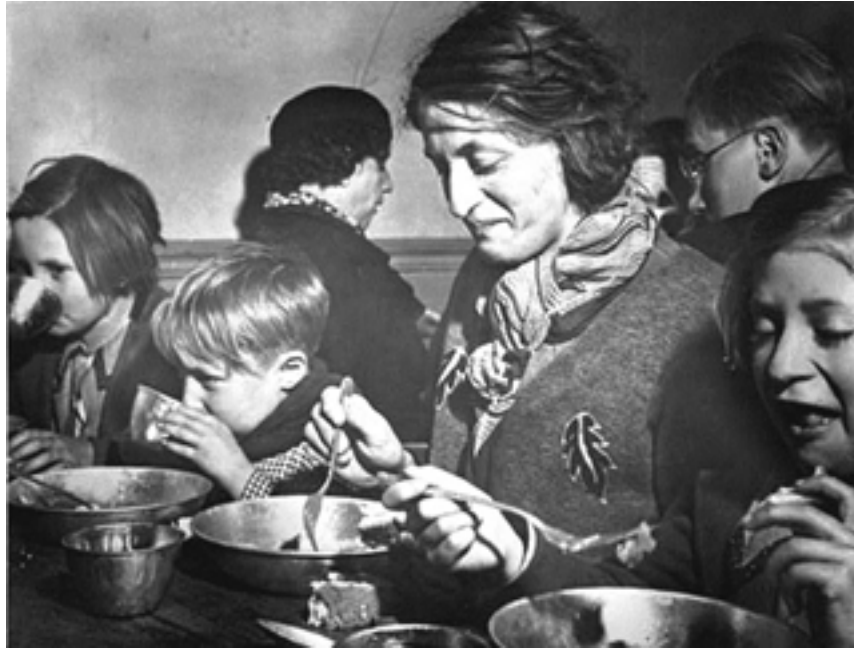
Paris, France, Refugee Camp WW II

What is at the very heart and center of existentialism, is the absolute character of the free commitment, by which every man realizes himself in realizing a type of humanity—a commitment always understandable, to no matter whom in no matter what epoch—and its bearing upon the relativity of the cultural pattern which may result from such absolute commitment. One must observe equally the relativity of Cartesianism and the absolute character of the Cartesian commitment. In this sense you may say, if you like, that every one of us makes the absolute by breathing, by eating, by sleeping or by behaving in any fashion whatsoever. There is no difference between free being—being as self-committal, as existence choosing its essence—and absolute being. And there is no difference whatever between being as an absolute, temporarily localized that is, localized in history—and universally intelligible being.