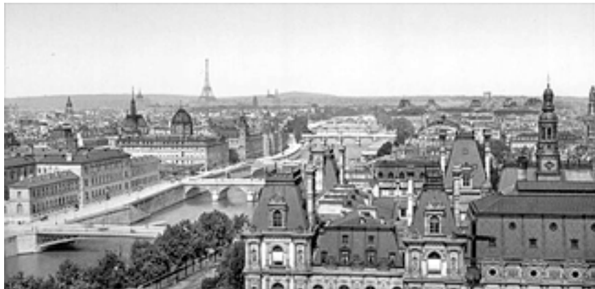
Seven Bridges, Paris

“There is no other universe except the human universe, the universe of human subjectivity.”