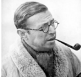
Jean-Paul Sartre , University of Pavia Galleries

About the author... Jean-Paul Sartre (1905-1980), a leading existentialist in post World War II France, advocates the radical freedom and concomitant personal responsibility of the individual. Although recognizing the constraints of the human condition and the limitations imposed by our environment, he also emphasizes the Cartesian assumption of the freedom of human consciousness. If we try to be “somebody” or “something,” Sartre argues we become inauthentic and are acting “in bad faith.” To try to make something of ourselves, as a purpose of life, is a mistake, for such an attempt would only tend to objectify what we are. No one wishes to be regarded as an object. Instead, Sartre emphasizes that each person is entirely the author of his choices—all significant aspects of choices are unconstrained by outside influences. When in 1960 Sartre exhorted the troops in the French Foreign Legion fighting in Algeria to desert, de Gaulle was asked why he took no action against Sartre. President de Gaulle replied, “One does not arrest Voltaire.” In keeping with Sartre’s view of authenticity, while declining the Nobel Prize for Literature in 1964, Sartre replied, “A writer must refuse to allow himself to be transformed into an institution.”