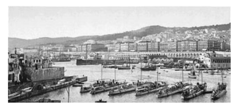
From the Admiralty, Algiers, Algeria

All Sisyphus's silent joy is here: his fate belongs to him. His rock is his thing. Likewise, when he contemplates his torment, the absurd man makes all idols be silent. In the universe suddenly given back to its silence, thousands of marveling little voices of the world arise. Unconscious secret calls, invitations from all the faces, they are the necessary reverse and the price of victory. There is no sun without shadow, and one has to know darkness. The absurd man says yes and his effort will henceforth have no ending. If there is a fated life destiny which is personal to each man, there is no superhuman destiny; more truly, there is only one for us all which the absurd man concludes is fatal and despicable. For the rest, he knows that he alone is master of his life. At that subtle instant when a man looks back over his life, Sisyphus walking downward to his rock contemplates the series of actions all together like dots on the curve of his destiny that has truly become his: it was created by him, is being perfected under the watchful eye of his memory, and will soon be sealed by his death. Thus, convinced of the very human origin of everything that is human, a blind man having the desire to see and knowing that the night has no end, Sisyphus is not out of step. The rock is still rolling.