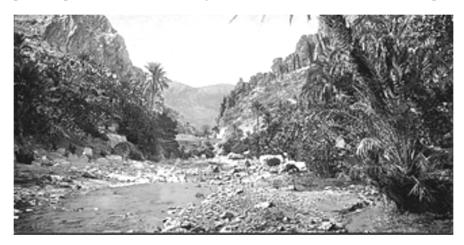
The River, El Cantara, Algeria

earth. When this long effort which is commensurate with boundless space, no sky, and fathomless time comes through the very end of its course, the purpose of it is achieved. Sisyphus then watches the rock as it hurtles down with a few bounds toward that lower world from whence he will have to push it up back to the summit. Again, he returns to the bottom of the slope.