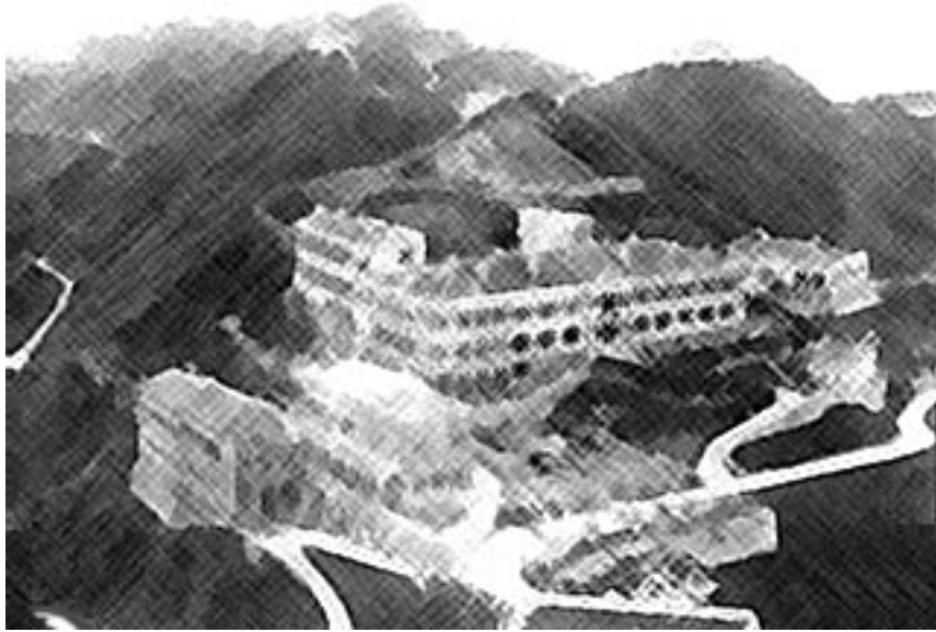
City on the Mountains—India