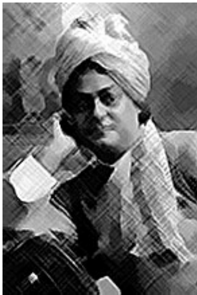
Swami Vivekananda, (detail)