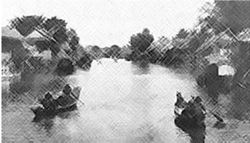
Riverfront

at the door of his religion any more than the burning of witches can be laid at the door of Christianity.