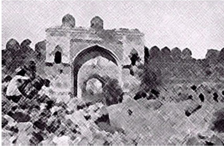
Delhi—Ruins of Shershak

my body is one little continuously changing body in an unbroken ocean of matter, and Advaita (unity) is the necessary conclusion with my other counterpart, Soul.