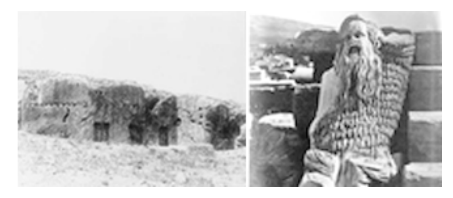
The Prison of Socrates and Statue of Pan, Theatre Bacchus, Library of Congress