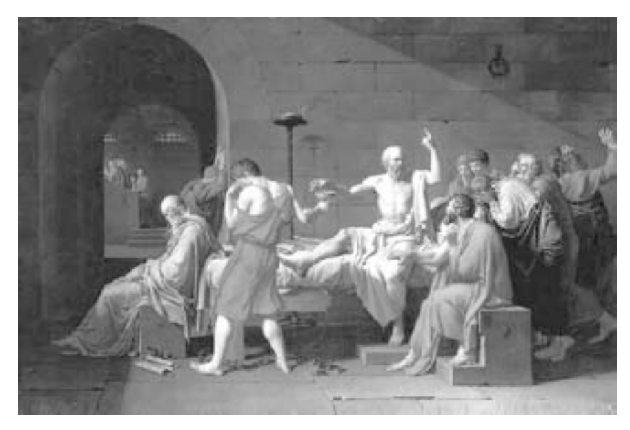
Jacques-Louis David, The Death of Socrates, Metropolitan Museum of Art